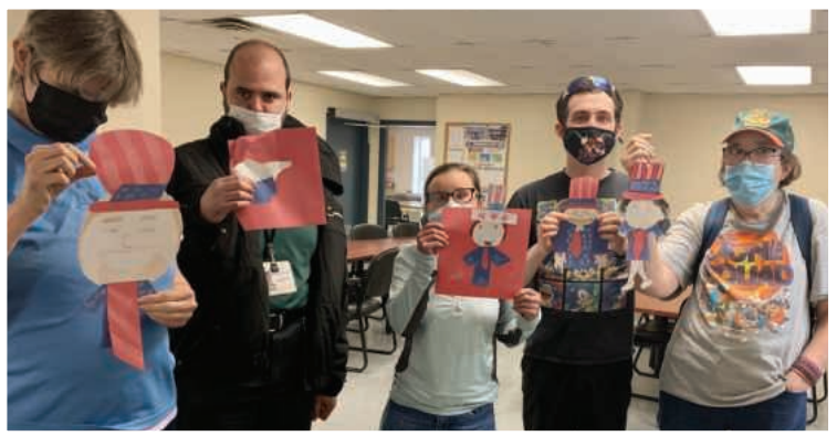
4th of July art projects